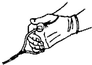
Dia. 42 Gripping the Hammer

The handle of the hammer is placed on the last joints of the fingers of the